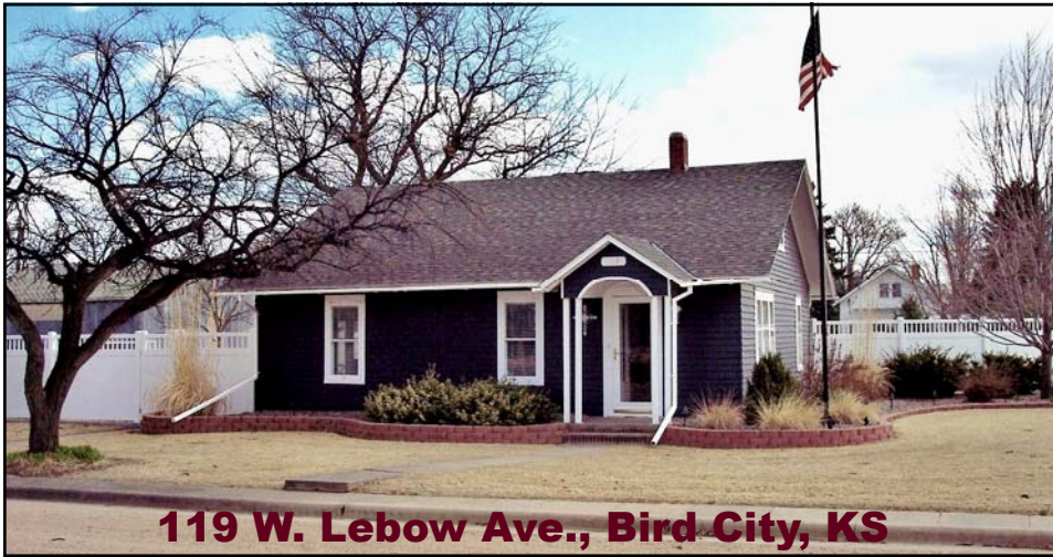
119 W. Lebow Ave., Bird City, KS